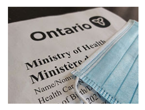
Unifor welcomes Ontario COVID-19 vaccine certificate program.