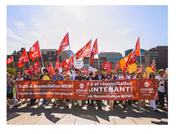
Unifor calls on the next federal government to take concrete and meaningful action on